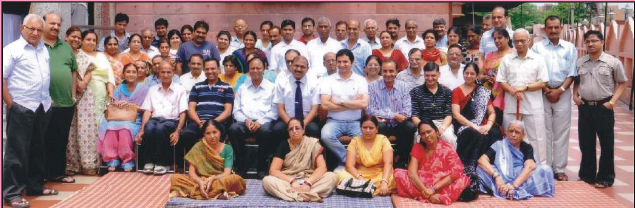
Saaol's 2 Day's Camp in Delhi 23rd & 24th July 2011, Sponsored by - Emami Foundation